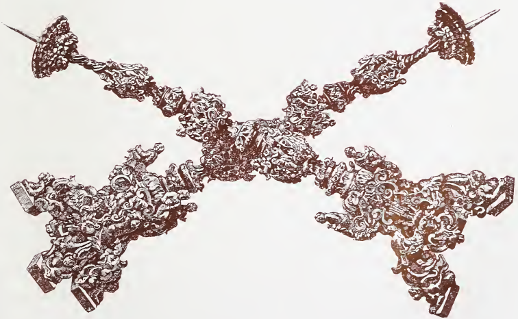
CANDELABRA. S. Maria di Carignano, Genoa.